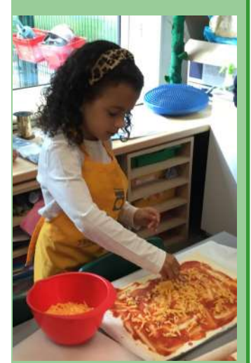
"Ready, Respectful, Safe" Kirklevington